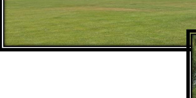
Views from Property